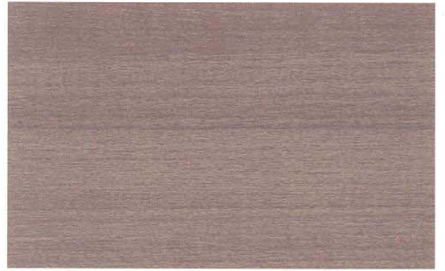
teka ceniza ash teak 1809