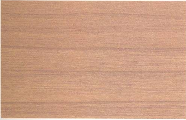
teka natural natural teak 1810