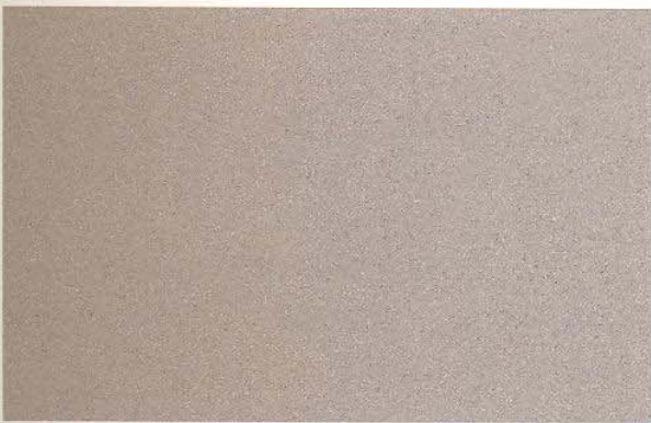
estructura aluminio aluminium structure